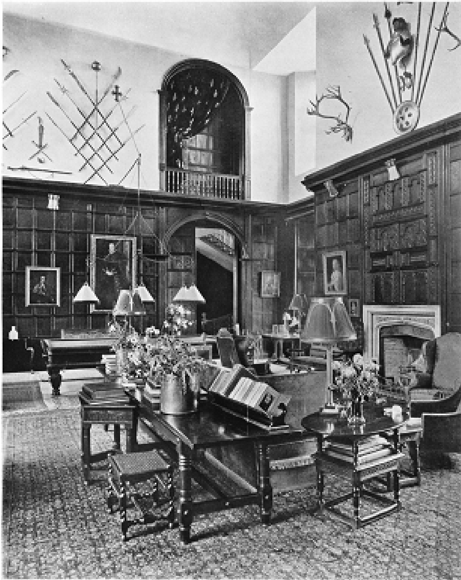
PLATE III. THE GREAT HALL, SUTTON PLACE BY SURREY